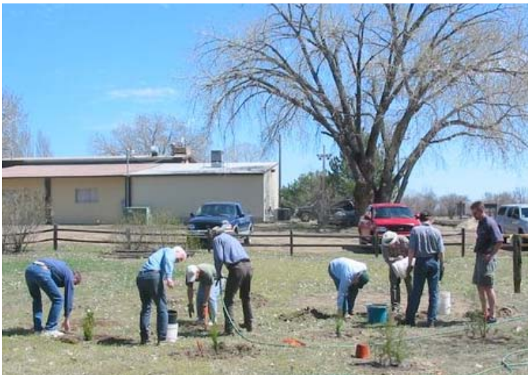
Arboretum Cleanup in Pierre