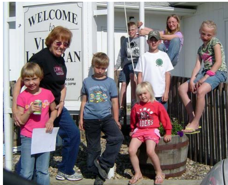
Planting day in Vivian