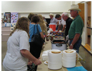
Lunch provided by the Rapid City Chamber Ag Committee.