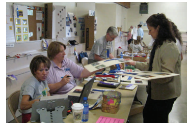
Scanning ribbon placing and attaching ribbons.