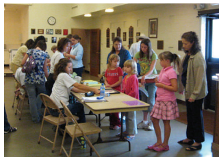
Checking in exhibits.