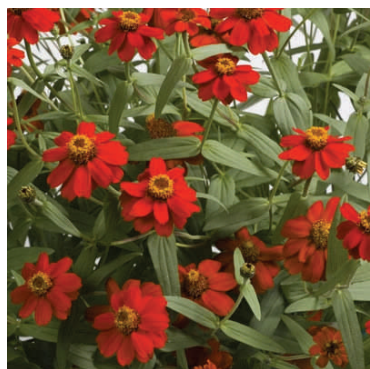
Zinnia Profusion 'Knee-High Red'

Voting will continue until August 31 st but consider voting today. The AAS website has a graph that illustrates how each plant is doing. While surfing the website be sure to check out all the past All American Selection winners for the past several years.