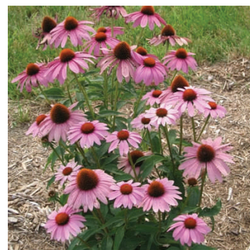
Echinacea 'Purple Splendor'™

Recently, I received an email from All-America Selections announcing "The American Garden Award" for 2010. They are asking for gardeners and professional horticulturists to vote on the plant they think have the most garden appeal. AAS has selected four different plants to choose from. They are hoping gardeners will purchase the plants and vote based on how well the plants do in their area. There are several ways to participate in the voting.