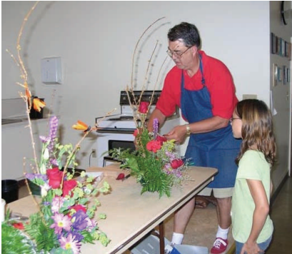
Flower Arranging Workshop