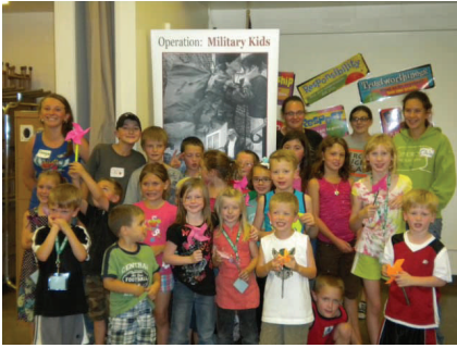
Operation Military Kids Day Camp